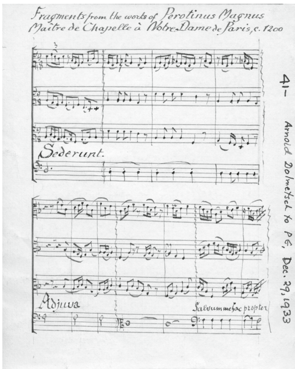
Fig. 7 Arnold Dolmetsch, arrangement of Pérotin's Sederunt (excerpt), sent to Percy Grainger in a letter of 29 December 1933 (DolmetschA 1933, reproduced by permission of the Estate of George Percy Grainger and the Dolmetsch family).

position of the bridge. The sound now emerges very easily and is of an extraordinary beauty.” 99 In his article of 1934, Arnold wrote: